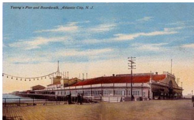
Young's Pier, Atlantic City, New Jersey

As an all-in-one entertainment center, the Casino bridged the gap between the two previous amusement parks and Joyland Park (1919-1928). However, its prime Seawall location and changing public tastes limited its longevity.