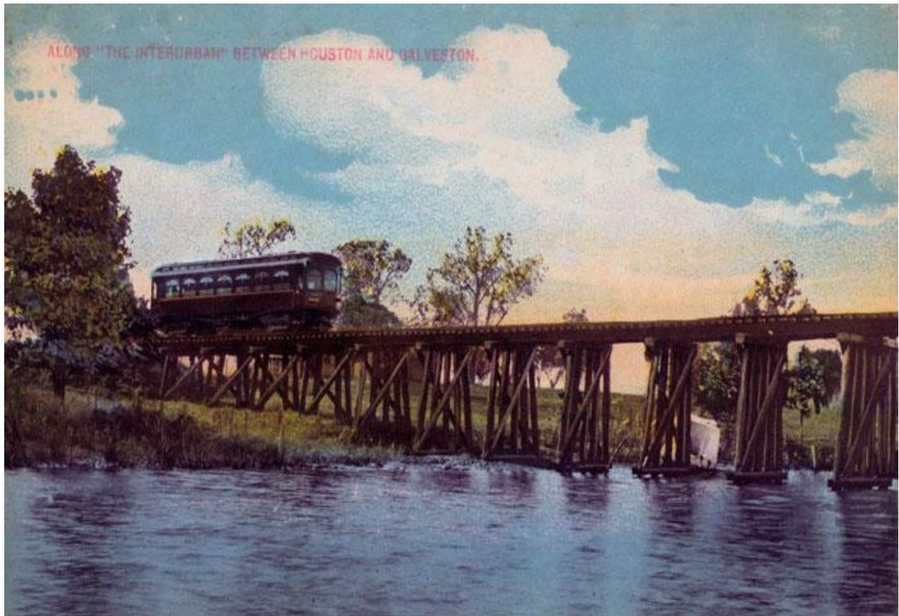
The Galveston-Houston interurban streetcar began service December 5, 1911. It lasted until 1936, when it was replaced by buses.