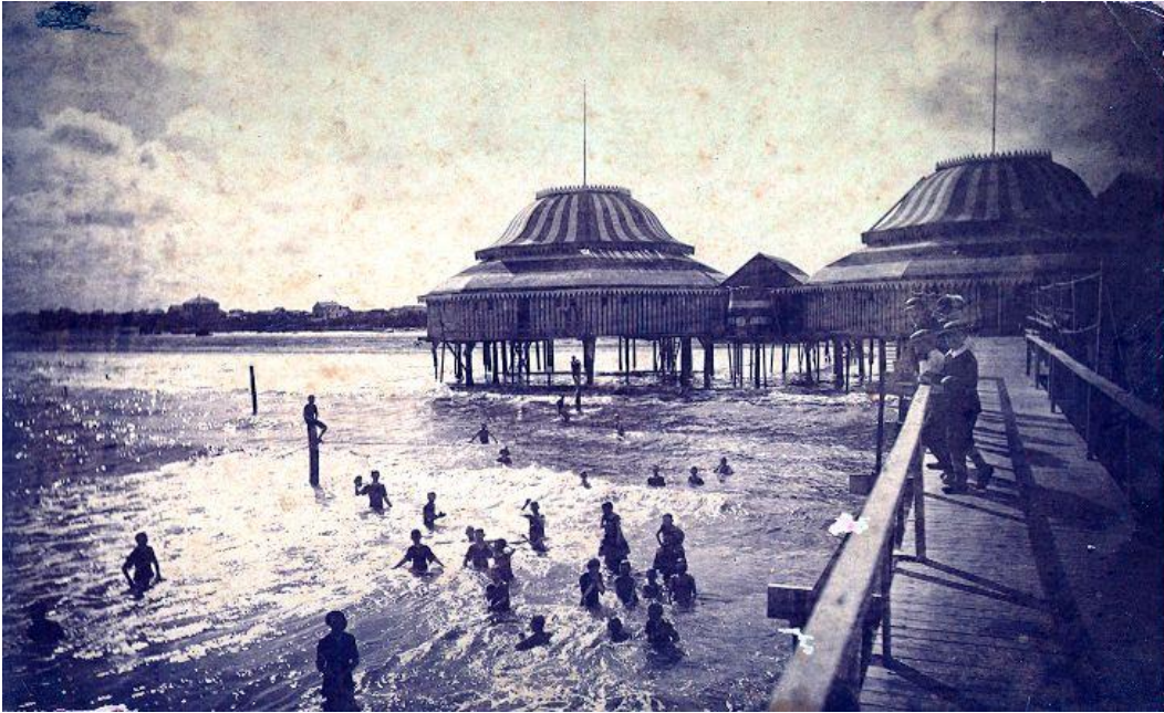
Pagodas bathhouse, circa 1887-1900. The bathhouse fell in the 1900 Storm.

Since the 1870s, Galveston's fine beaches and moderate climate have drawn visitors from other parts of Texas, as well as other states. Spectacular traces the city's emergence as a beach resort in the context of the development of leisure in the United States and the evolution of technology, such as streetcars, that facilitated tourism.