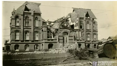
The original Galveston Orphans Home was destroyed by the 1900 storm, but rebuilt and much later converted into the Bryan Museum.

Even today, the devastation is staggering, almost incomprehensible. In almost cinematic language, this is how the National Parks Service describes the 1900 Galveston hurricane: